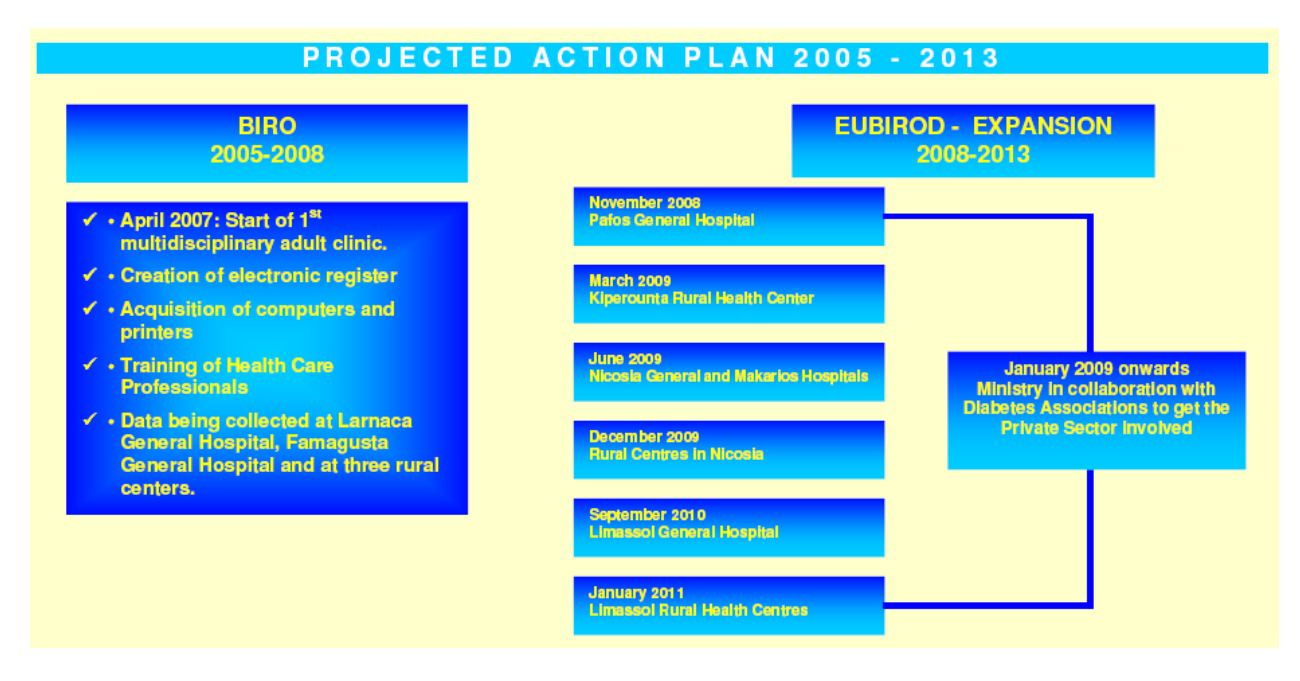
Figure 1: BIRO Action plan in Cyprus

The Projected action plan for Cyprus is as formalised by the prospective workplan described in Figure 1.