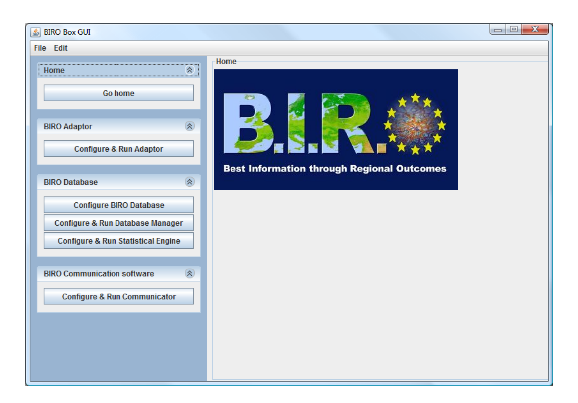
Figure 6: The main screen of the BIRO BOX GUI.

Each of the main screen work areas contains a number of individual functions that are serviced by the specific technologies that configure the BIRO database and configure and run the adaptor, the database manager, the statistical engine and the BIRO communicator.