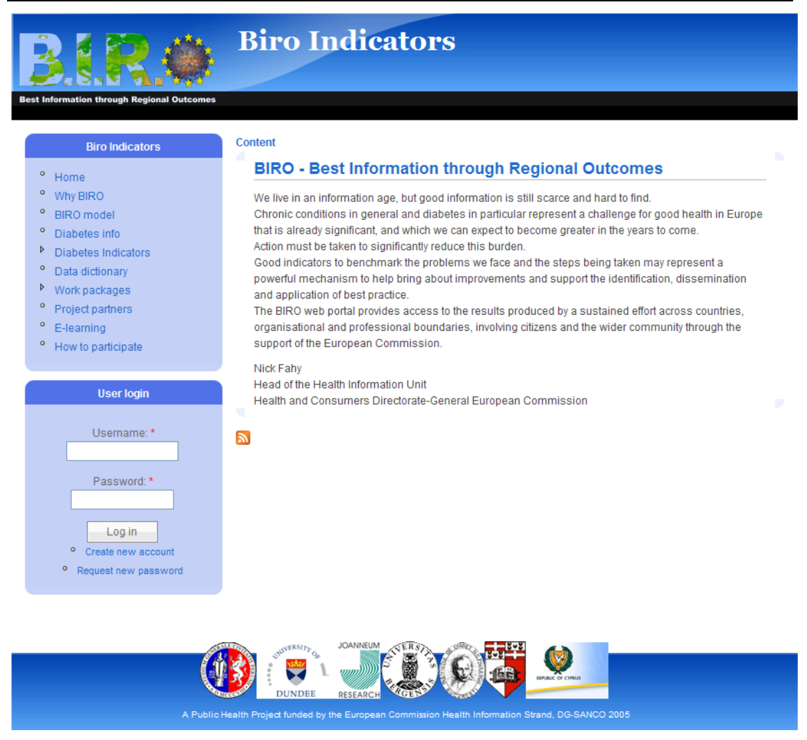
Figure 1: Home page